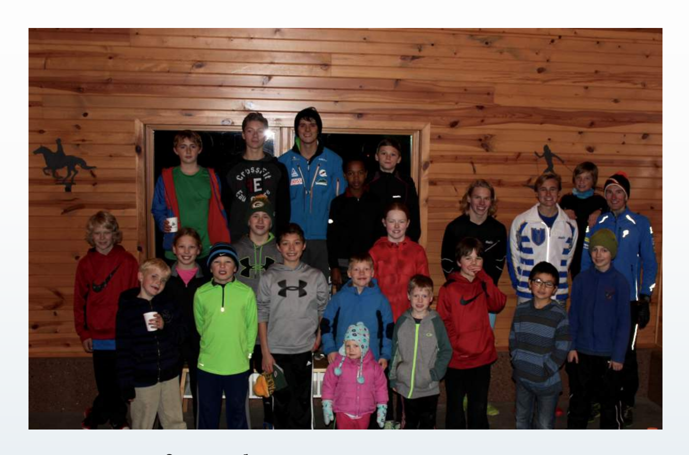
I never forget where my roots are at.